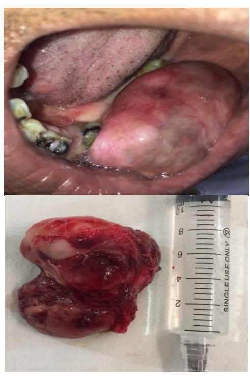
Figure 1. A preoperative picture of buccal mucosa and surgical specimen measuring 8 \times 5 \times 4 cm

A 60-year-old male patient referred to the Oral and Maxillofacial Surgery Department, Abbasi Shaheed Hospital, Karachi, Pakistan. The patient had a history of swelling on lower lip (right side) for the past five years, which slowly increased in size. There was no history of pain and no known comorbidity. Extra oral physical examination showed a soft, fluctuant, circumscribed, and painless mass. Intraoral examination showed a mucosa covered lump originating from left mandibular canine to posterior area. The lesion involved the entire buccal vestibule and measured 8 × 5 × 4 cm (Figure 1).