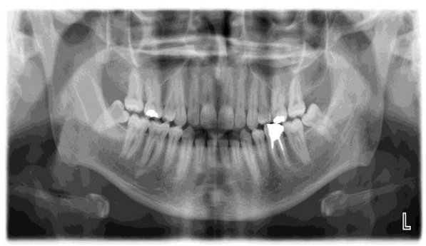
Figure 2. Missing of right and left maxillary and mandibular second premolars

The most common involved teeth in dilaceration were mandibular first premolars, followed by mandibular second premolars.