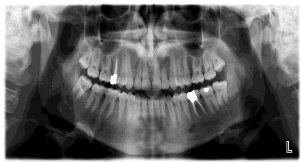
Figure 1. Dilaceration of left maxillary and mandibular premolars

The most common involved teeth in dilaceration were mandibular first premolars, followed by mandibular second premolars.