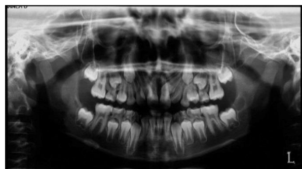
Figure 2. Panoramic view