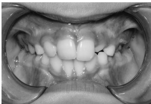
Figure 3. No disturbances in the eruption of the adjacent teeth were seen

Parents and siblings of the patient were also examined, and no history of congenital dental anomalies or syndromes was observed. The parents were informed of this anomaly and the potential future complications. The patient was referred to the oral surgeon for definitive treatment. Unfortunately, due to economic issues, parents did not accept any treatment.