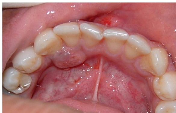
Figure 2. Clinical appearance of the lingual gingival growth at the initial presentation

continuity of the basement membrane and the malignant epithelial cells were seen invading the connective tissue in form of thin cord. All the features were suggestive of "well differentiated SCC" (Figure 3).