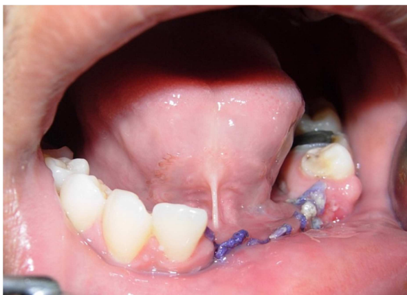
Figure 4. Clinical image after wide excision of lower gingivobuccal sulcus with marginal mandibulectomy

regularly and no evidence of residual neoplastic disease has been detected during 3 years of postsurgical periodic clinical follow-up examination.