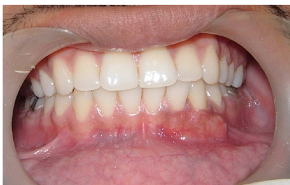
Figure 1. Clinical appearance of the labial gingival growth at the initial presentation

On examination, there was a single, isolated 1.5 × 1.0 cm, reddish-pink gingival growth present between 32 and 33. The lesion was firm, fixed and non-mobile (Figure 1). Lingually, there was an isolated gingival growth about 0.7 × 0.7 cm. It was sessile, firm, ovoid, reddish pink, smooth surfaced and non-fluctuant (Figure 2). Both the growths were mildly tender on digital pressure with no discharge and no blanching on pressure. The teeth were non-mobile and vital. There were no signs of involvement of regional lymph nodes. Radiographic examination showed no signs of abnormal bony destruction. All the routine blood tests were within normal limits. An excisional biopsy of both the growths was performed under local anesthesia. Healing was uneventful for the lingual biopsy; however, the labial biopsy site showed minute lobulations during the healing phase.