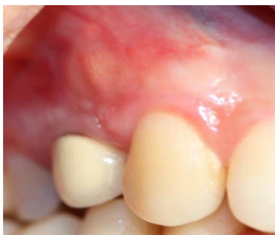
Figure 1. The maxillary right first premolar: Crown on the tooth and periapical abscess

A 30-year-old healthy woman referred with a chief complaint of recurrent swelling and abscess in the periradicular region of right maxillary first premolar tooth and sensitivity to percussion (Figure 1).