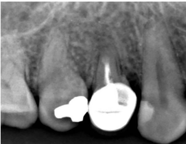
Figure 3. The tooth after replacing amalgam with the mineral trioxide aggregate (MTA) after the 2-year follow up period

manufacturer instruction and placed in root-end cavity. The patient was instructed to use 500 mg amoxicillin every 8 hours for 5 days. The flap then repositioned and sutured carefully. The patient was followed up for 2 years both clinically and radiographically (Figure 3).