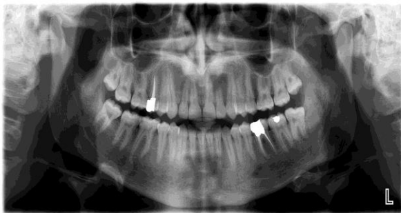
Figure 1. Dilaceration of left maxillary and mandibular premolars

The most common involved teeth in dilaceration were mandibular first premolars, followed by mandibular second premolars.