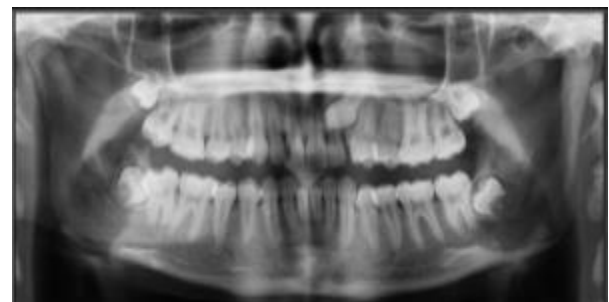
Figure 3. Impaction of left maxillary canine

was the most frequent missing teeth, followed by maxillary permanent lateral incisor. Maxillary canines and mandibular second premolars were the most incident impacted teeth. Supernumerary tooth was the next common anomaly with the incidence rate of 6.6%. Out of the 22 supernumerary teeth, mesiodens was the most common supernumerary tooth detected among 8 men and 3 women with the ratio of 2:1.