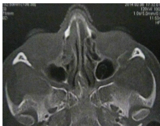
Figure 1. Complete success of closed reduction of a patient with nasal bone fracture

The study was approved by Vice Deputy of Research at Kerman University of Medical Sciences. For the purpose of this research, all personal information was excluded from both pre-operation and post-operation CT scans and coded stereotypes were presented to expert panel. The expert panel comprised of two oral and maxillofacial surgeons and two radiology specialists who had no information about the patients. Coded stereotypes were analyzed and interpreted by the expert panel and the quality of reduction was reported in terms of complete success rate (nearly complete anatomic reduction), favorable success rate (acceptable non-anatomic reduction) and absolute failure (no acceptable reduction). In cases of complete success, all broken bones were relocated in their anatomic position (Figure 1).