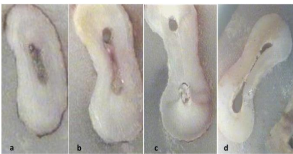
Figure 2. Types of isthmus, sections, and distances from the apex respectively in mesial root of mandibular second molars (MSMs): (a) Type V, first section, 2 mm; (b) Type V, second section, 4 mm; (c) Type II, third section, 6 mm; (d) Type IV, third section, 6 mm

C-shaped canals composed 3.7% of the samples and showed isthmus at all the 3 sections. Table 1 lists the comparison of the incidence and type of isthmuses at mesial and distal roots and C-shaped canals at different levels of tooth sectioning. In addition, figure 2 shows various types of isthmuses at different sections. The incidence of isthmus at mesial roots' sections from the apex was as 61.3%, 75.1%, and 80.1% at 2, 4, and 6 mm, respectively. Similarly, the incidence of isthmus at two canalled distal roots was, 6.4%, 21.2%, and 36.4% at 2, 4, and 6 mm, respectively from the apex; with complete connections being the most common type (type V). Moreover, there was a significant difference in the distribution of isthmuses (P < 0.001).