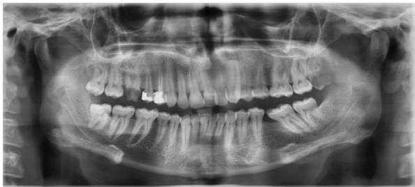
Figure 6. The case and control lower third molars were compared in relation to their impaction, the root length, and the curvature of the apex

Of 128 radiographs evaluated, 6 radiographs were excluded from the study due to the absence of root formation or lack of agreement between the two observers on apex curvature. Of 122 remaining cases (29.5%, 95% CI: 21.6-38.4), 36 cases exhibited differences between the case and control sides, with apex curvature in 33 cases on the control side (Figure 6).