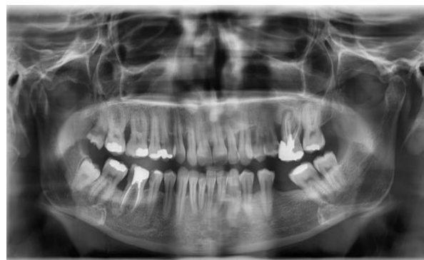
Figure 1. The case and control lower third molars were compared in relation to their development, impaction, number of roots, and the mesiodistal width of crown

Table 1 presents the frequencies of the developmental stages of third molar crowns on the case and control sides in terms of Olze factor.