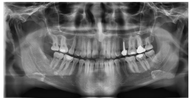
Figure 4. The case and control upper third molars were compared in relation to their root length

In 128 radiographs evaluated, 5 cases were excluded from the study due to the absence of root formation; in 40 of the 123 remaining cases (32.5%, 95% CI: 24.4-41.6), there were differences in the root length between the case and control cases, with longer roots in 95 cases (87.5%) and longer roots in 5 cases on the control side (Figure 4).