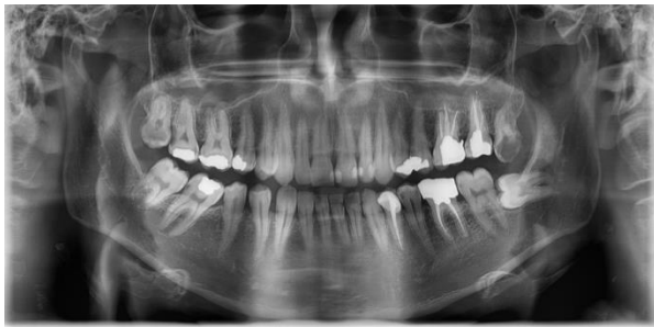
Figure 2. The case and control lower third molars were compared in relation to their impaction

The P-value is significant at the 0.002 level