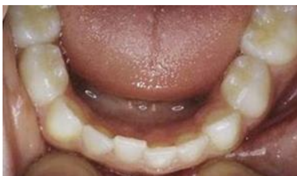
Figure 2. Closed arch in primary dentition

primate space or anthropoid space that is present between lateral incisor and canine in the maxilla and between canine and primary first molar in the mandible as well as generalized space or developmental space that is present between the anterior teeth and sometimes between the primary molars in addition to the anterior teeth. 2