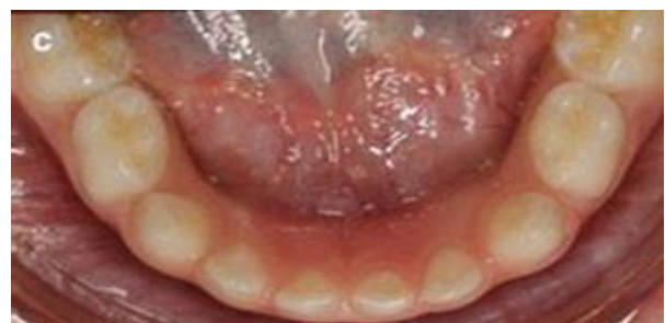
Figure 1. Open arch in primary dentition

The presence of developmental spaces during the primary dentition period is called open arch (Figure 1). In the absence of such developmental spaces, the dental arch is called the closed arch (Figure 2), and crowding is rarely observed in the primary teeth. 1