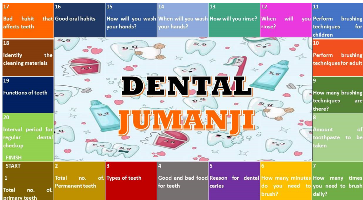
Figure 1. Game Board Dental Jumanji

The baseline data of knowledge was collected. The school children were randomly allocated to the two groups using computer-generated randomization software. 9 The