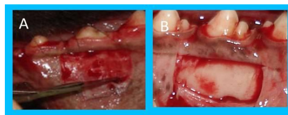
Figure 2. Periosteal fenestration bed (A) and denuded bed (B)

placed on the bed and sutured. All surgical procedures were done by a periodontist who was not blind to this study.